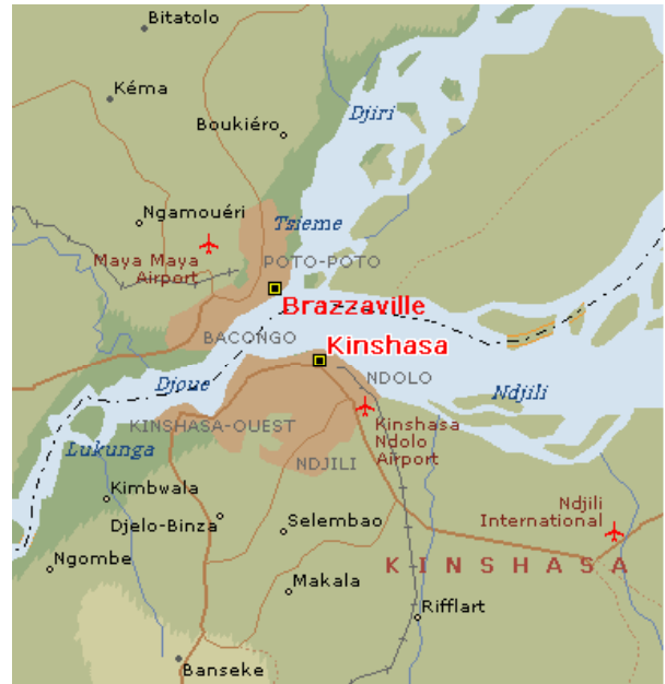
The Congo River

very well received. The proximity of the two countries will be very helpful in providing the necessary help.