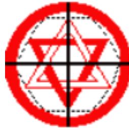
L-C de Saint-Martin's Universal Pantacle (1778)